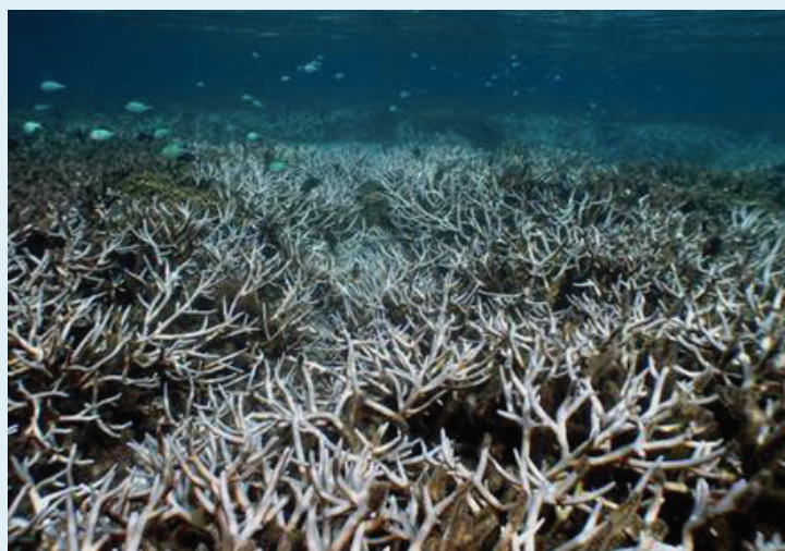
Bleached corals in the Tumon Bay Marine Preserve in 2007.

Warming and acidification could result in widespread damage to marine ecosystems. Guam is home to a diverse array of fish species. Sharks, rays, grouper, snapper, and hundreds of other fish species rely on healthy coral reefs for habitat. Reefs also protect nearshore fish nurseries and feeding grounds. A significant fraction of reef-dwelling fish are likely to lose their habitats by 2100. Increasing acidity would also reduce populations of shellfish and other organisms that depend on minerals in the water to build their skeletons and shells.