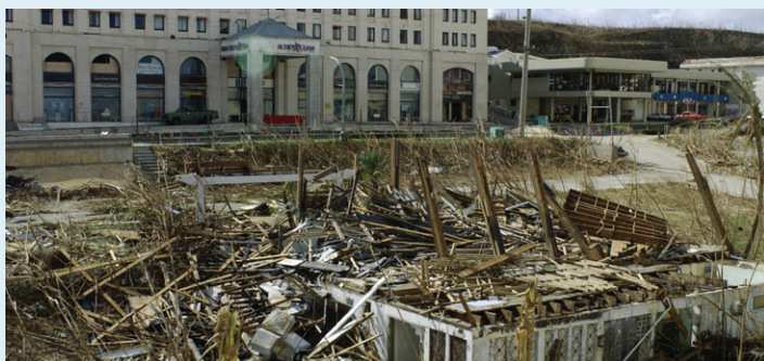
Damage caused by Typhoon Pongsona in 2002.

As the climate changes, typhoons may cause more damage. Guam lies in one of the world's most active regions for tropical storms. In 2002, Typhoon Pongsona caused $700 million in damages, destroyed 1,300 homes, and left the island without power. In just the last few years, neighboring islands have suffered from some of the strongest and most damaging tropical cyclones ever recorded, including Super Typhoons Haiyan (2013), Maysak (2015), and Soudelor (2015). Although warming oceans provide typhoons with more potential energy, scientists are not yet sure whether typhoons have become stronger or more frequent. Nevertheless, wind speeds and rainfall rates during typhoons are likely to increase as the climate continues to warm. Higher wind speeds and the resulting damages can make insurance for wind damage more expensive or difficult to obtain.